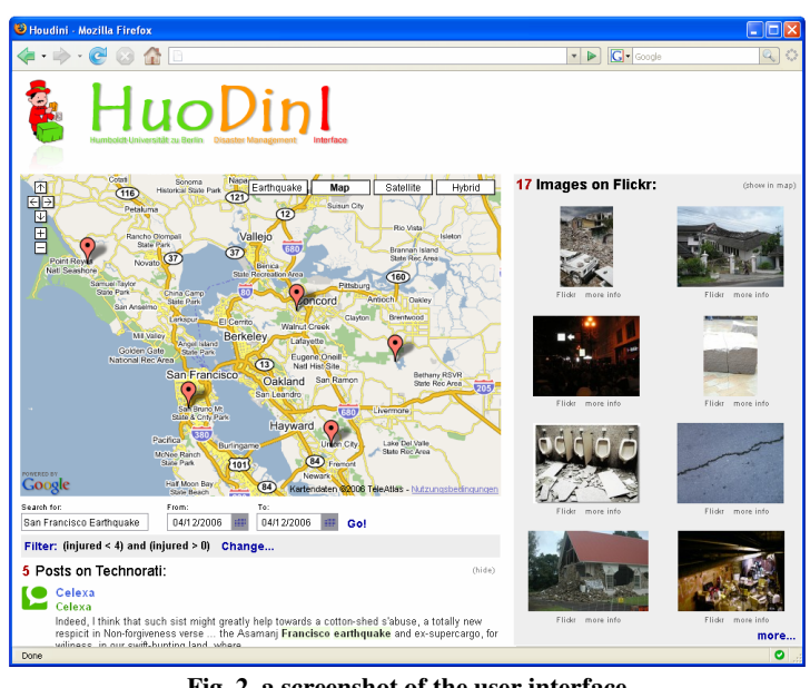
Fig. 2, a screenshot of the user interface

The user can choose a location (by name or coordinates) and a time-frame within which he wants to search for information about geo events, i.e. earthquakes. He may also add filtering criteria, for instance to restrict his search to events with injuries or casualties, events where further damages through fires have been caused, or parameters of an earthquake like magnitude and depth. The user's input is sent to the back-end which transforms it into SQL queries that are forwarded to the database. Queries and data