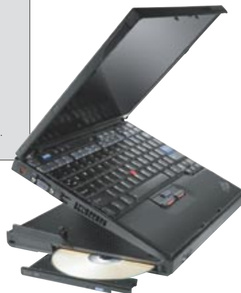
IBM ThinkPad X40 notebook with optional IBM ThinkPad X4 UltraBase Dock and DVD-ROM Ultrabay Slim Drive.

– Aaron Goldberg, Vice-President, Ziff-Davis Market Experts