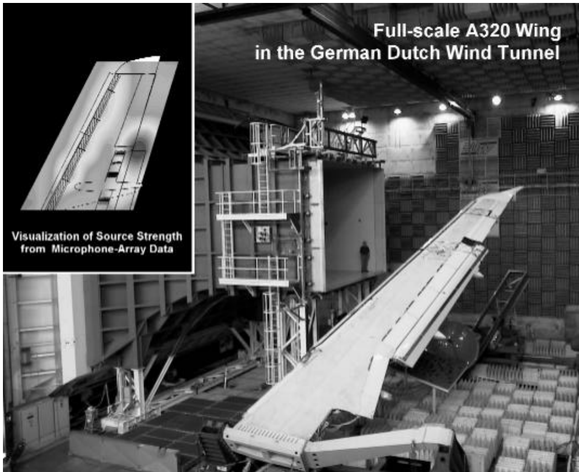
Figure 3. Photograph and source strength visualisation from full-scale test of an Airbus A320 wing in the German Dutch wind tunnel (DNW).