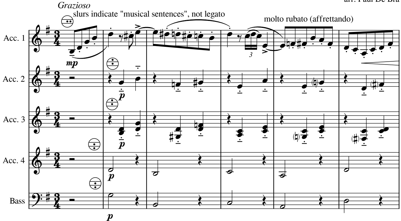
(trills not in original score, but played by Fritz kreisler himself)